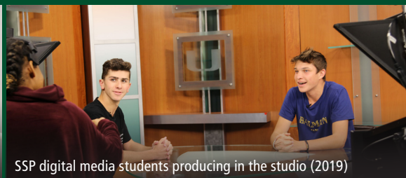
SSP digital media students producing in the studio (2019)