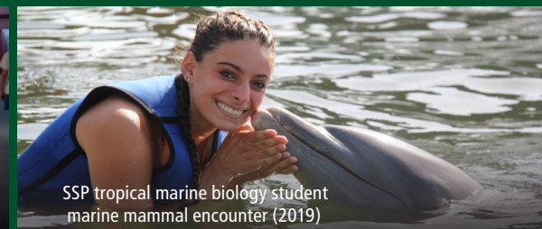
SSP tropical marine biology student marine mammal encounter (2019)