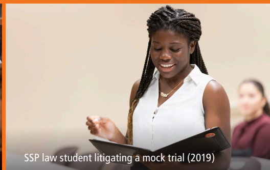
SSP law student litigating a mock trial (2019)