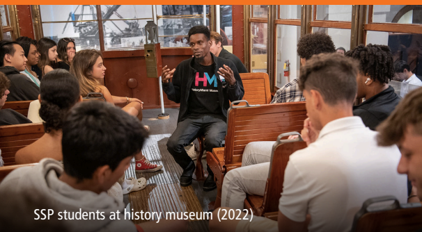
SSP students at history museum (2022)

COURSES ARE SUBJECT TO CHANGE For the latest course listings, please visit miami.edu/precollege