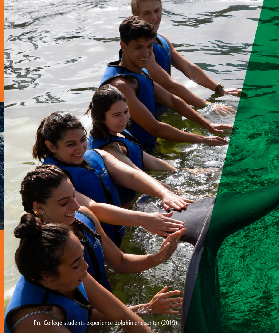
Pre-College students experience dolphin encounter (2019)