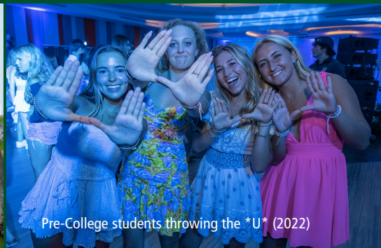
Pre-College students throwing the *U* (2022)

“The Summer Scholars program helped me realize what college classes would look like, as well as giving me a peek into residential life at college. The Program allowed me to explore my interest in marine science and helped me meet new people from around the country. I would definitely recommend this program to others!”