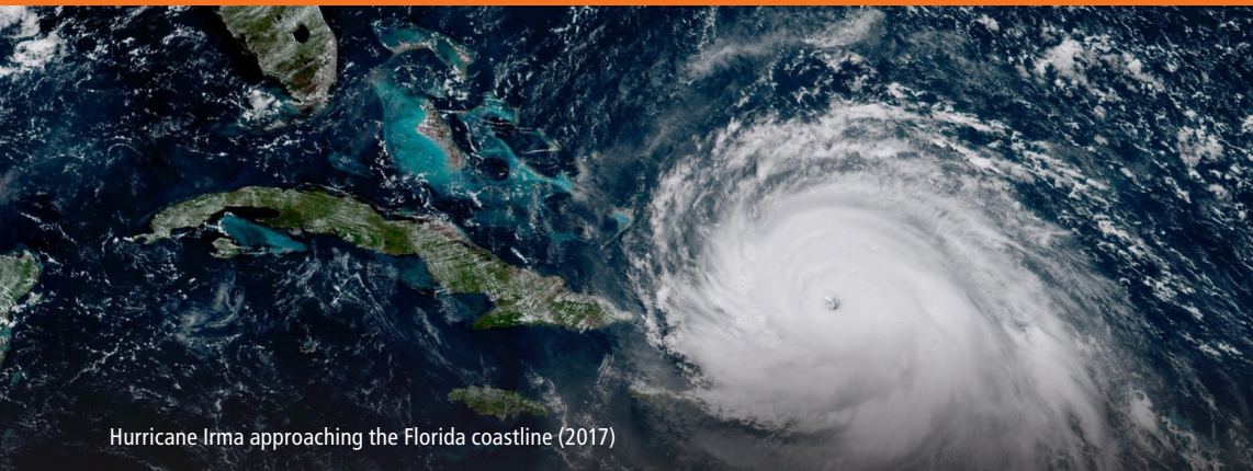
Hurricane Irma approaching the Florida coastline (2017)