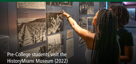
Pre-College students visit the HistoryMiami Museum (2022)