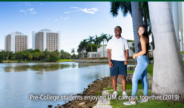
Pre-College students enjoying UIM campus together (2019)

Students use their free time to work on class assignments, study at the library, swim at the campus pool, exercise at the Wellness Center, explore the campus, and join evening and weekend activities. On weekends, students have the opportunity to explore Miami and South Florida by participating in activities organized and chaperoned by program staff. Weekend activities may include: snorkeling in Key Largo, attending a Miami Marlins baseball game, touring Miami Beach and Wynwood, and earning community service hours.